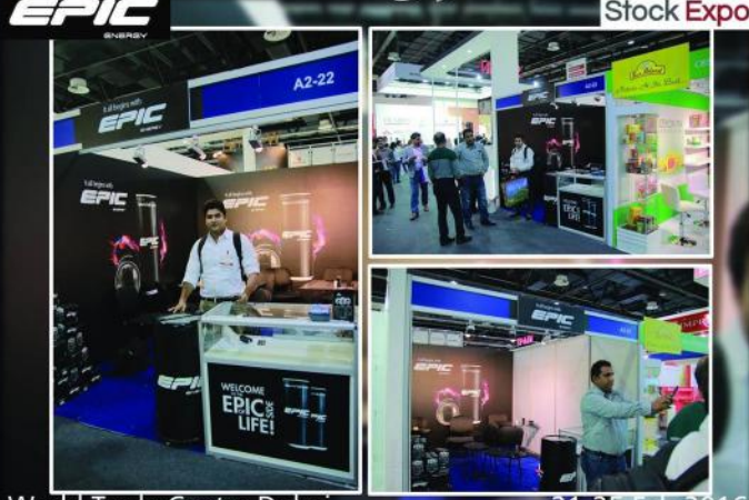
World Trade Centre Dubai 21-25 Feb 2016