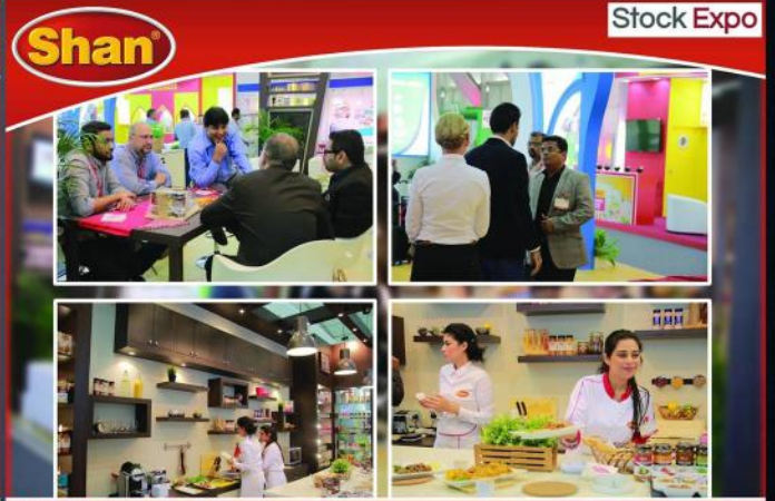
World Trade Centre Dubai 21-25 Feb 2016