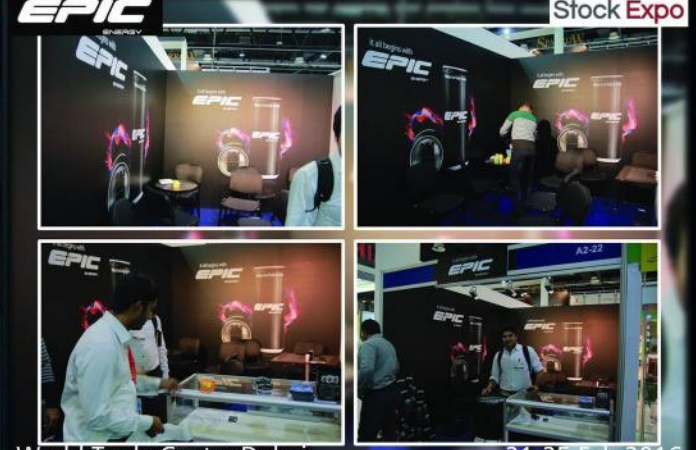
World Trade Centre Dubai 21-25 Feb 2016