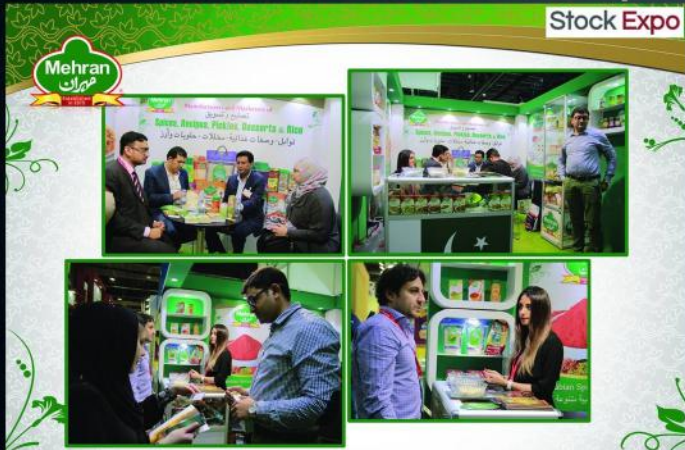
World Trade Centre Dubai 21-25 Feb 2016