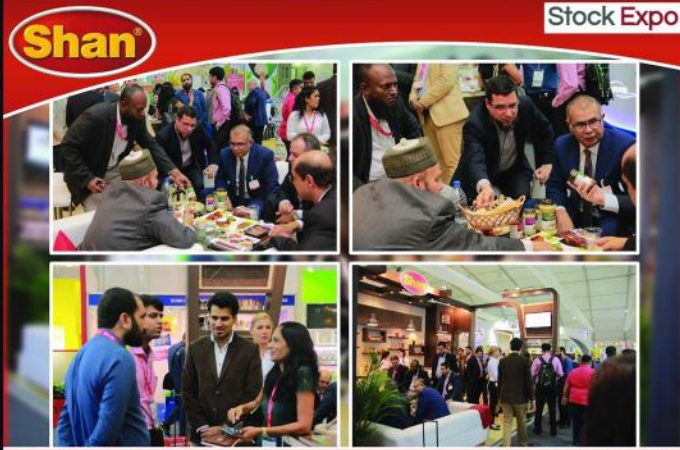
World Trade Centre Dubai 21-25 Feb 2016