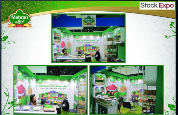
World Trade Centre Dubai 21-25 Feb 2016