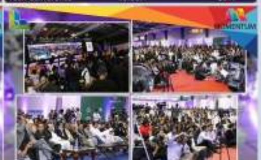
Momentum Tech Conference Expo Center Karachi 6-7 February 2017