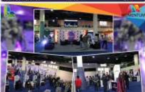
Momentum Tech Conference Expo Center Karachi 6-7 February 2017