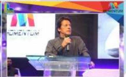
Momentum Tech Conference Expo Center Karachi 6-7 February 2017