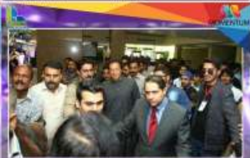
Momentum Tech Conference Expo Center Karachi 6-7 February 2017