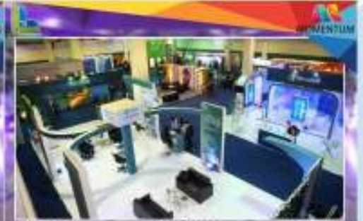
Momentum Tech Conference Expo Center Karachi 6-7 February 2017