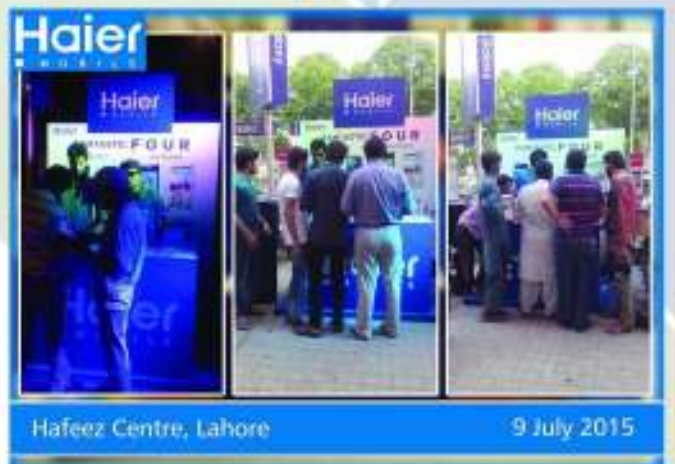
Hafeez Centre, Lahore