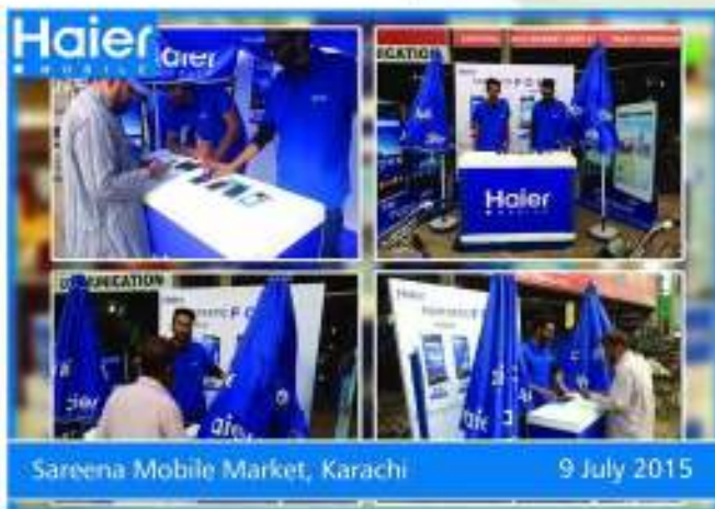
Sareena Mobile Market, Karachi