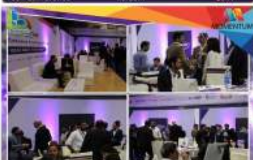
Momentum Tech Conference Expo Center Karachi 6-7 February 2017