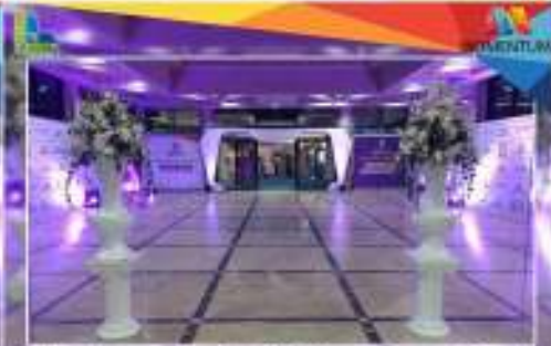
Momentum Tech Conference Expo Center Karachi 6-7 February 2017