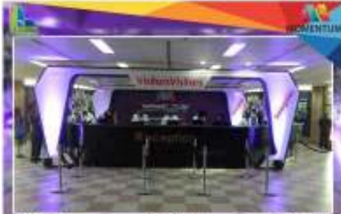
Momentum Tech Conference Expo Center Karachi 6-7 February 2017

Momentum Pakistan 2017 is first ever premier gathering of the brightest minds and top entrepreneurs, investors, incubators/accelerators, academic institutions, Mobile network operators, financial institutions, tech companies, government officials and media in