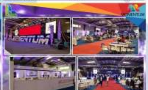
Momentum Tech Conference Expo Center Karachi 6-7 February 2017