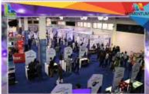
Momentum Tech Conference Expo Center Karachi 6-7 February 2017