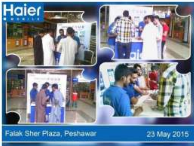
Falak Sher Plaza, Peshawar

Cities covered were Karachi, Lahore, Islamabad, Hyderabad, Sukkur, Multan, Faisalabad, Gujranwala, Sargodha & Sialkot.