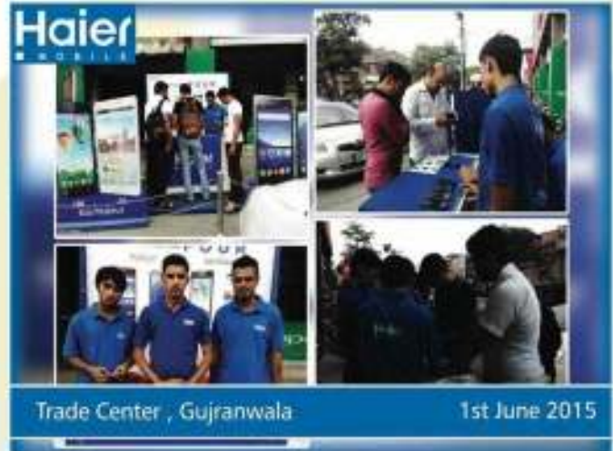
Trade Center, Gujranwala