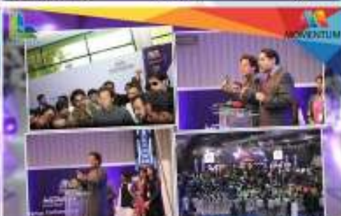
Momentum Tech Conference Expo Center Karachi 6-7 February 2017