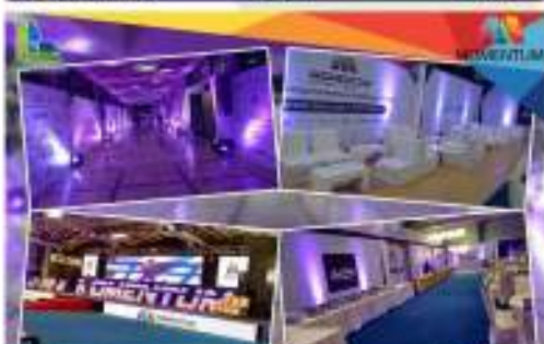
Momentum Tech Conference Expo Center Karachi 6-7 February 2017