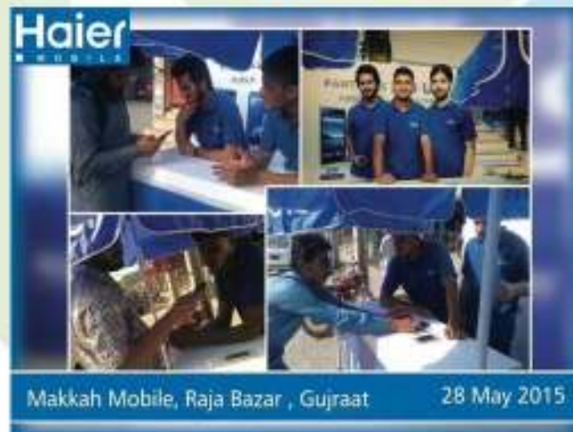
Makkah Mobile, Raja Bazar, Gujrat